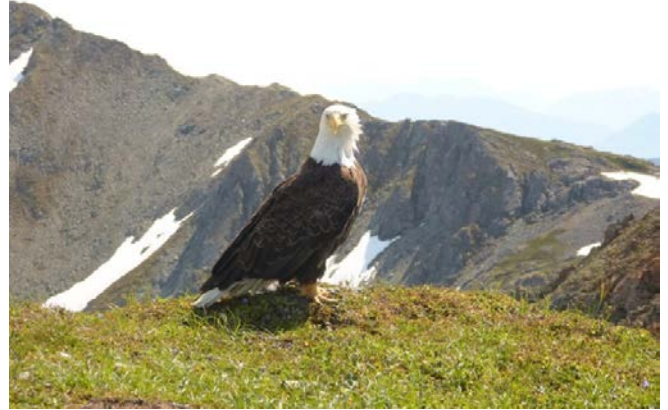
Bald Eagle near Mount Roberts

When visiting Juneau expect to immediately find an abundance of Common Ravens, Northwestern Crows, and Bald Eagles. On the water in spring and late summer Surf and White-winged Scoters are Common. Marbled Murrelets are often spotted off shore. Gulls, especially Glaucous-winged, Herring and Mew; also, Bonaparte's are common in the summer. All forest or even shrub areas ring with the beautiful songs of Varied, Hermit and sometimes Swainson's thrushes. Other common regional songbirds include Chestnut-backed Chickadee, Pacific Wren, Oregon Junco, and Steller's Jay.