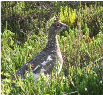
Rock Ptarmigan in the alpine

There are no specific birding guides/companies in Juneau at this time, but many local companies do offer hikes or whale watch tours - and the companies in general have guides that are quite knowledgeable of local birdlife. Guided tours are available however, in Hoonah, see https://www.facebook.com/icystraitbirding/