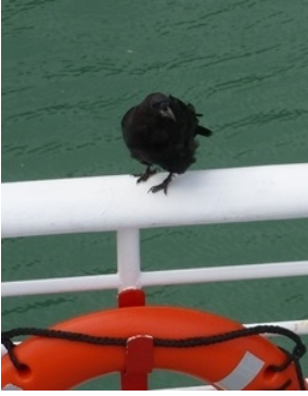
Northwestern Crow boards ferry.

Ferry passengers. From the ferry dock check out the Auke Village Recreation Area http://www.recreation.gov/recreationalAreaDetails.do?contractCode=NRSO&facilityId=236212 Representative near-shore and forest birds occur. Open areas are good for Red-breasted Sapsuckers and Sooty Fox Sparrows in summer.