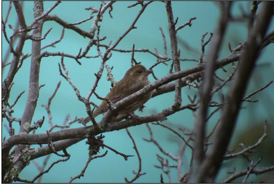
Figure 11. Purple Finch at Ketchikan 2 January 2010.

HOUSE SPARROW: At least four House Sparrows wintered in Ketchikan (three were recorded on the Ketchikan CBC 19 December 2009; AWP)—part of the flock of seven birds that were present at the end of the fall season.