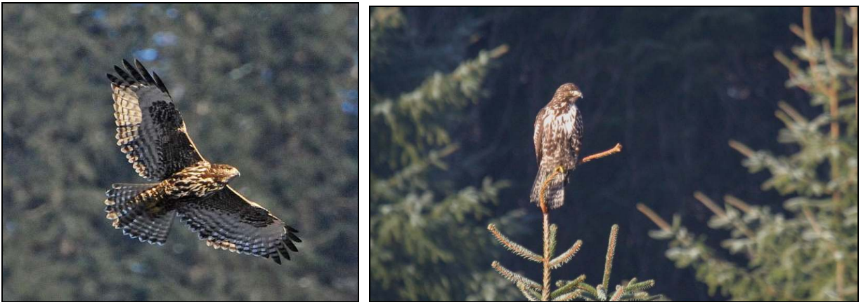
Figure 2. Immature Harlan's Red-tailed Hawk ( Buteo jamaicensis harlani ) at Juneau 13 December 2009 (left; photo Robert H. Armstrong) and 20 January 2010 (right; photo by Nick R. Hajdukovich).

RED-TAILED HAWK: At least two Red-tailed Hawks wintered at Ketchikan, one wintered at Sitka (fide MRG), and another was reported at Wrangell 17 December 2009 (MC). This hawk is a very rare winter visitant in southern Southeast Alaska. An immature Harlan's Red-tailed Hawk ( Buteo jamaicensis harlani ) successfully wintered at Juneau, where this species is distinctly casual in winter (GBV, m.obs.; Figure 2).