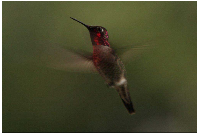
Figure 8. This adult male Anna's Hummingbird spent the entire winter at a Ketchikan feeder; it was photographed here on 28 January 2010.

ANNA'S HUMMINGBIRD: An adult male Anna's Hummingbird successfully wintered at a Ketchikan feeder (SC; JHL, Figure 8). Another unidentified hummingbird at a Wrangell feeder through 16 December 2009 was also likely this species (fide CLR).