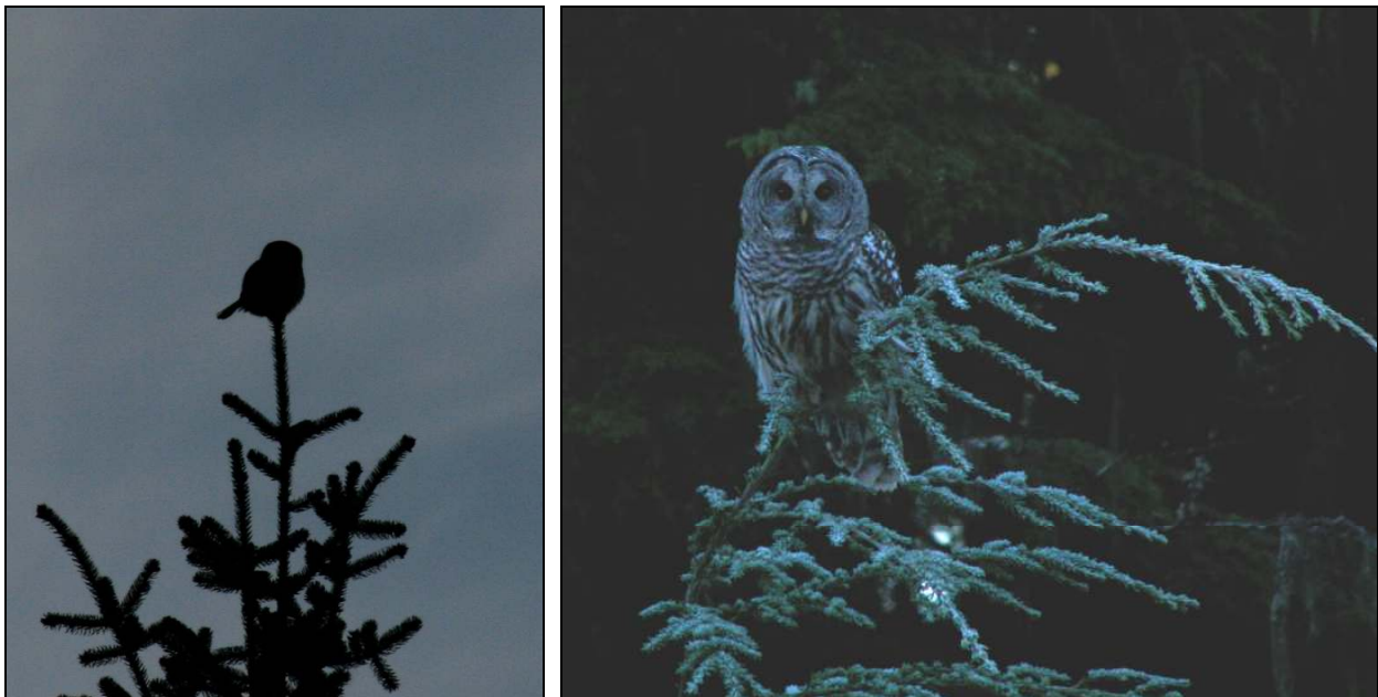
Figure 7. Northern Pygmy-Owls were frequently sighted on the Juneau roadsystem this winter (left; 23 January 2010; photo by Nick R. Hajdukovich ). The Barred Owl was photographed at Juneau 30 December 2009 ( photo by Gus B. van Vliet ).

SNOWY OWL: One Snowy Owl was found at Ketchikan 11 January 2010 (MAW).