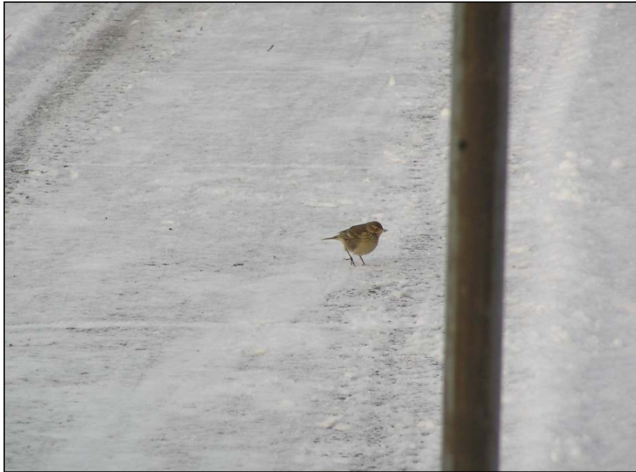
Figure 9. This American Pipit was found staggering down a frozen sidewalk on the Ketchikan CBC 19 December 2009.

VARIED THRUSH: Very large numbers of Varied Thrushes lingered into December at Ketchikan and 234 on the CBC 19 December 2009 was a new high count for the circle. Numbers declined after late December. Elsewhere, normal small numbers were reported (e.g., only five was the high count at Juneau all winter; NRH) and maximum of only eight at Sitka 3 January 2010 (MW, MT).