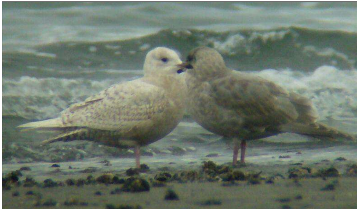
Figure 6. The very pale overall appearance, long wings and whitish primaries, small rounded head, tiny, bicolored bill, and finely barred tertials that lack darker centers, easily identify the gull on the left as a 1 st -cycle Kumlien's Iceland Gull—photographed at Juneau 5 February 2010.

BONAPARTE'S GULL: One at Ketchikan 3 January 2010 (AWP, SCH) was rare, as the species typically departs Southeast Alaska by mid-December.