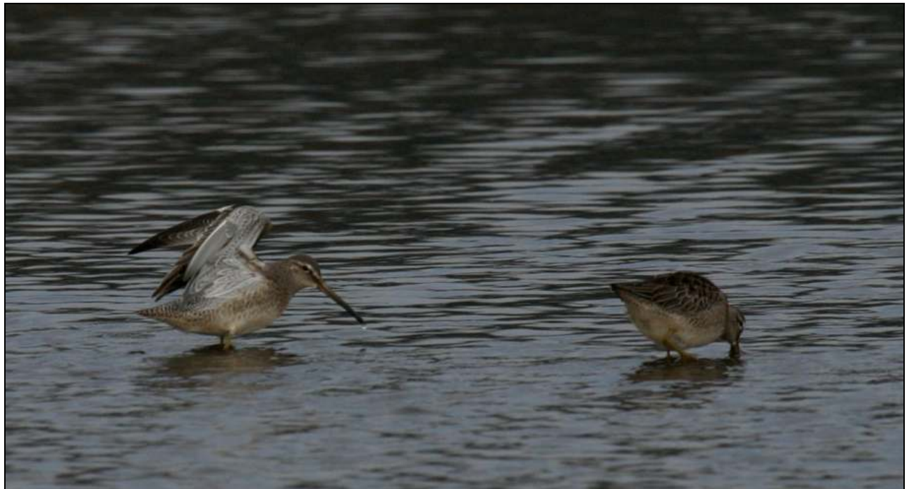
Figure 5. These Long-billed Dowitchers at Juneau's Mendenhall Wetlands (here, 20 January 2010) provided only the 2 nd mid-winter report of this species in Alaska.