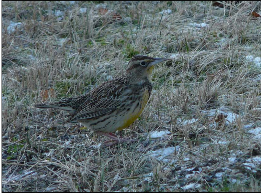
Figure 10. This Western Meadowlark was found feeding along the grassy edge of busy Tongass Avenue in Ketchikan 13 December 2009.

RUSTY BLACKBIRD: This species made a good showing this winter. Up to four males found at Ketchikan over the course of the season provided the first local winter records. A flock of 50 was found at Gustavus on 7 February 2010 (NKD) and flocks of more than 20 were reported on three dates in Juneau, with a maximum of 26 on 7 February 2010 (BUK). This species is a rare winter visitant to Southeast Alaska (Kessel and Gibson 1978).