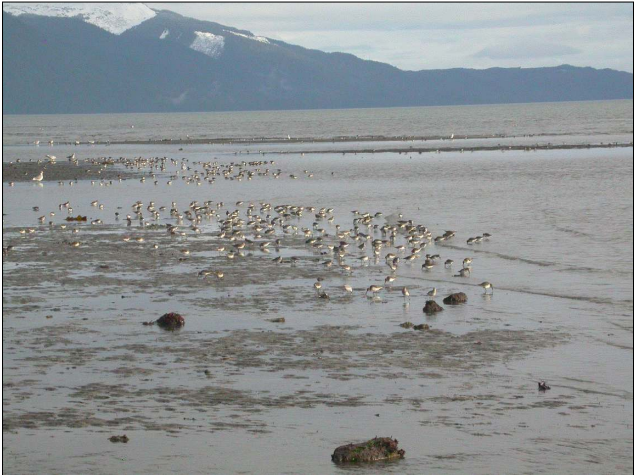
Figure 3. Mudflats in the vicinity of Gustavus provide important wintering habitat for shorebirds, including Sanderlings, Dunlin, and Rock Sandpipers. This photo was taken near the mouth of Rink Creek 25 February 2010.