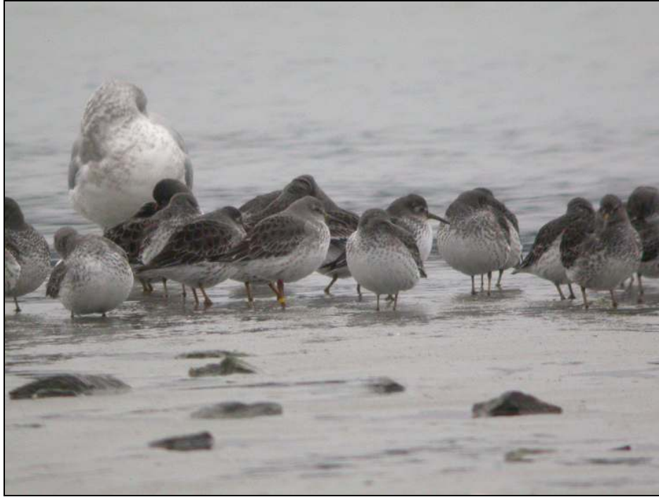
Figure 4. This flock of Rock Sandpipers was photographed at Gustavus 24 February 2010. Note the yellow band on the bird just left of center; it was banded in western Alaska in 2007.