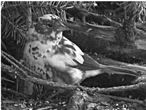
Leucistic Fox Sparrow

A California Gull and a Brewer's Blackbird were seen on 4/18. A Mountain Bluebird and a Golden Eagle were seen on 4/25. Cackling Geese were seen on two dates in mid-April. Two color-banded Dunlin were seen in early April. Both were banded as juveniles in 2005 on the Yukon-Kuskokwim Delta. A Leucistic Fox Sparrow was at a feeder for about a week. It was mostly white with brown splotches, primaries, and tail.