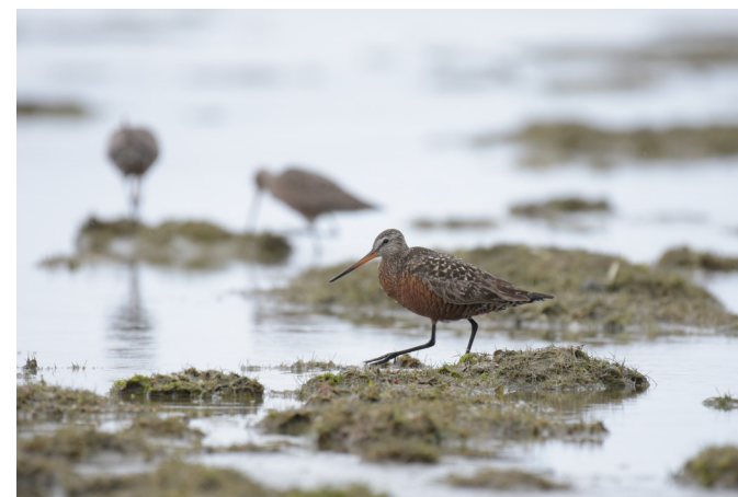
a Hudsonian Godwit at the Eagle Beach State Recreational Area